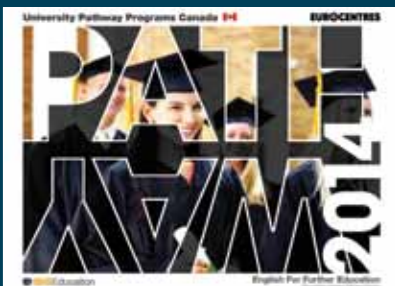
ISIS Canada Pathway Program