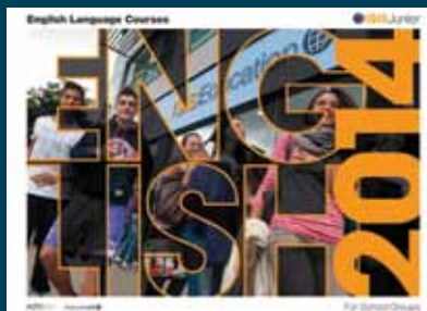
ISIS Junior Off Season Courses