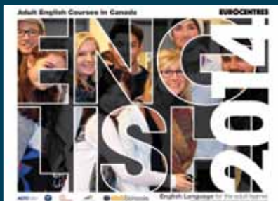
ISIS Canada Adult Courses