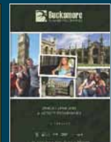
Buckmore Summer Programmes