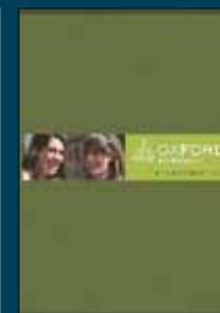
Oxford Tutorial College A-Level Programmes