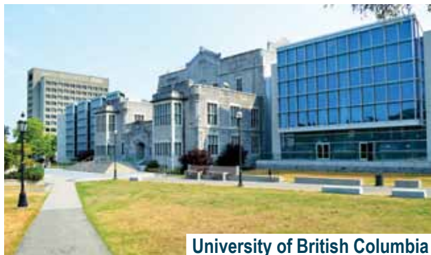
University of British Columbia